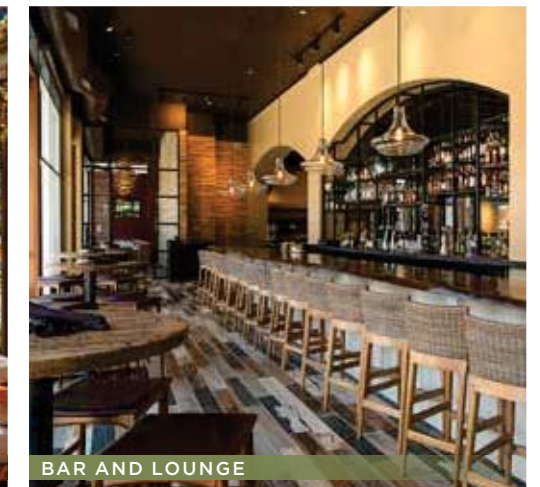
BAR AND LOUNGE