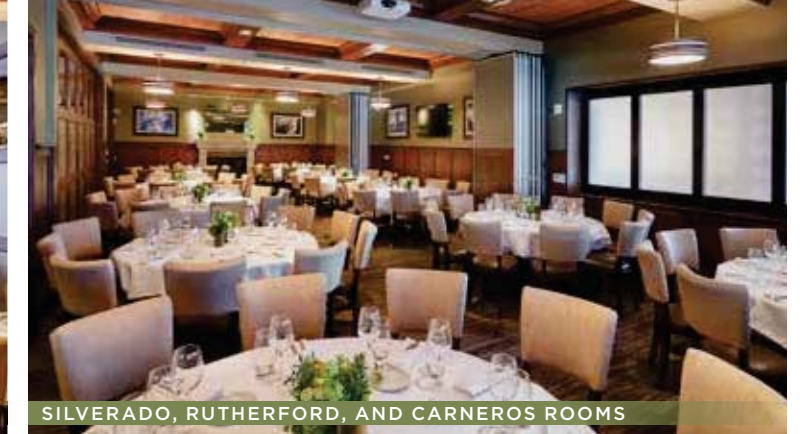
SILVERADO, RUTHERFORD, AND CARNEROS ROOMS