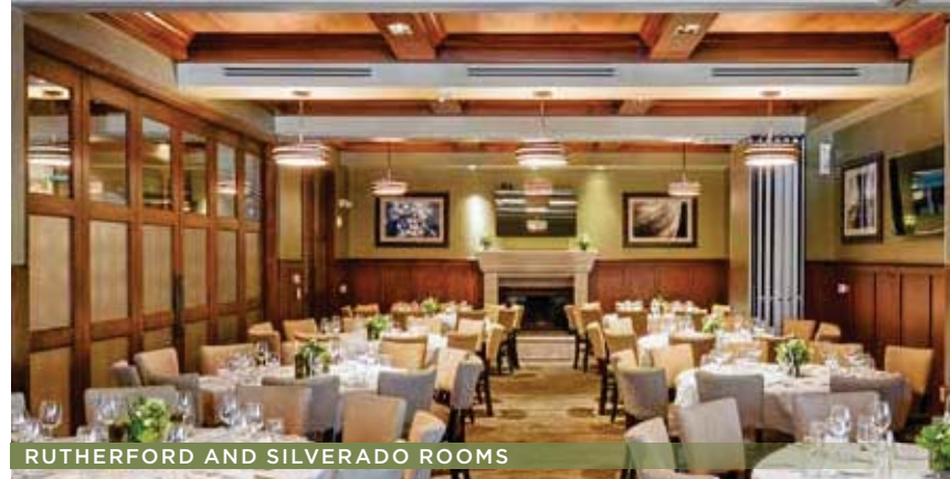
RUTHERFORD AND SILVERADO ROOMS

Seated events for up to 100 guests Reception-style for up to 125 guests