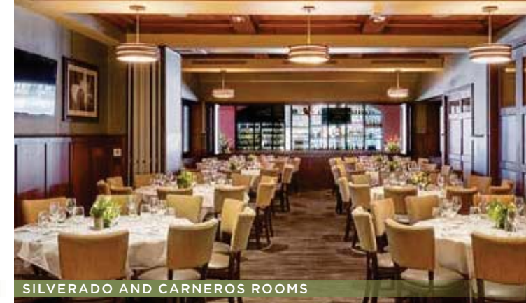
SILVERADO AND CARNEROS ROOMS