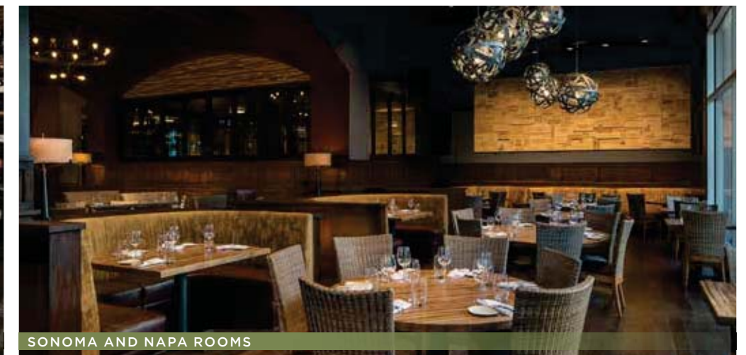
SONOMA AND NAPA ROOMS